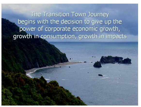
Modern Pop Mythology helps to understand the paradigm shift needed for the Transition

The final point of the first session presentation was to recognise that tragic and stupid things have been done, and will continue to be done. The scientific facts of resource depletion and environmental destruction are often experienced like other dreadful news. The reality of the damage already done should be grieved for, but the suggestion was left that people need to work together and move on.