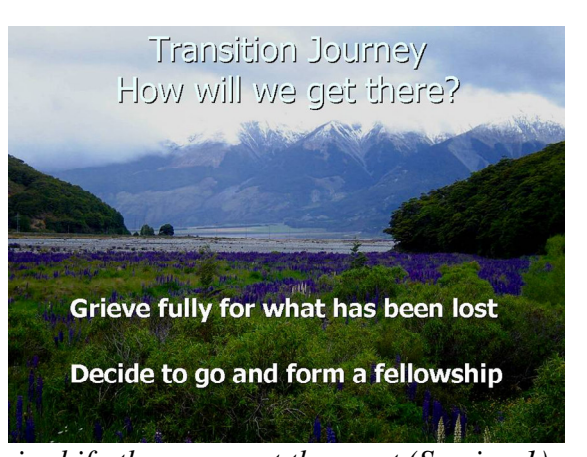
Moving forward is a process; don't be surprised if others are not there yet (Session 1)