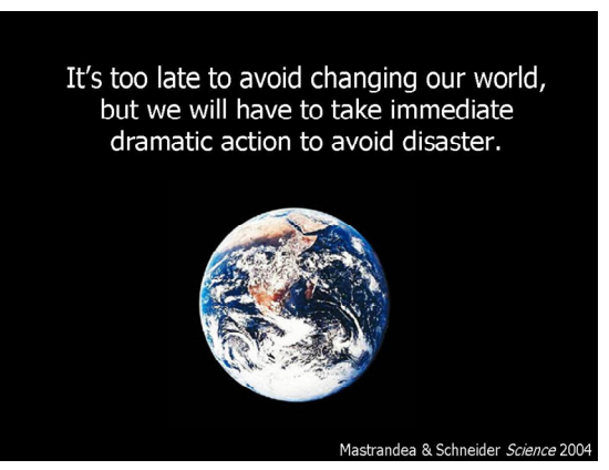
Let's face the facts and understand the how our world is changing (Session 1)